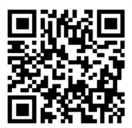
scan the QR code with your phone's camera for Parent Guides on how to help keep your children safe online

They feel they can't turn to parents or a trusted adult for support as they fear they may get in trouble or have their devices taken away from them. It can carry on all day, all evening and all weekend for the world to see, causing a lot of emotional stress to the victim and their family.