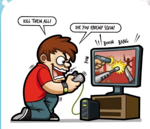
A Parent's Guide to Gaming