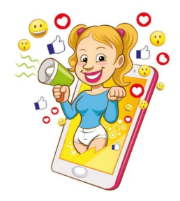
A Parent's Guide to Online Influencers