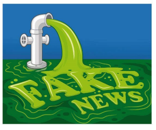
A Parent's Guide to Fake News